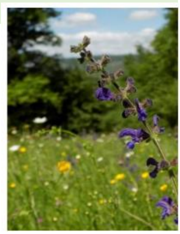
Meadow sage on "Colorful Meadow", Hummelberg Kusterdingen